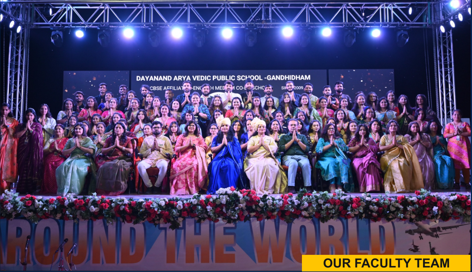
OUR FACULTY TEAM